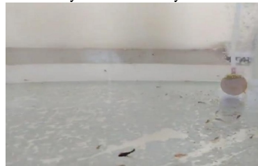
Young ones with fully develop fins