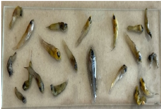
Mortality of Black and Common Molly Fish