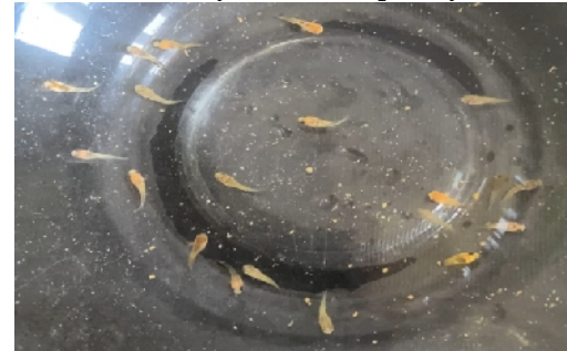
Fry of Common Molly Fish