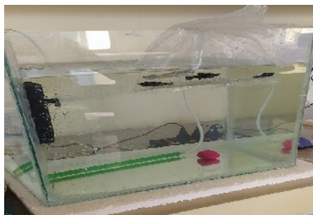
Acclimatization of fishes