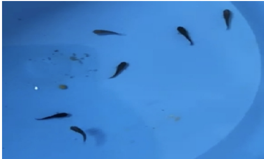
Just after Spawning (Black molly fry)