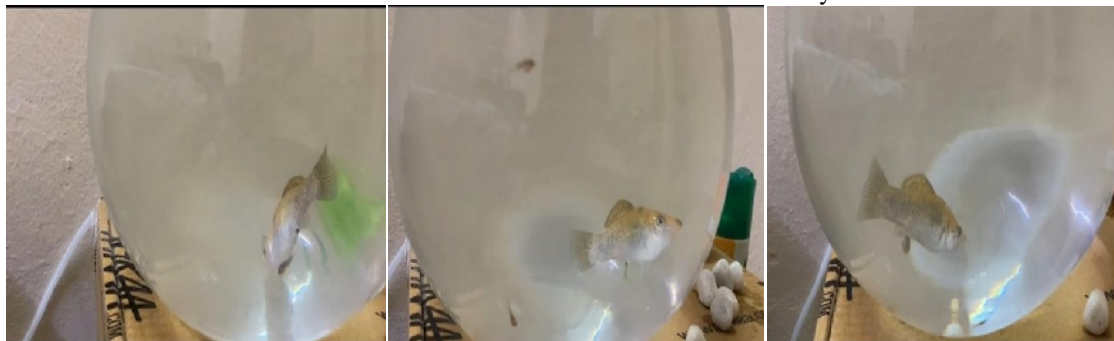
Spawning of Molly Fish