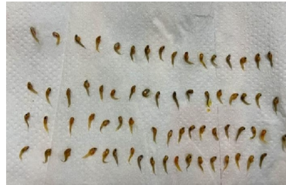
Mortality of undeveloped fry