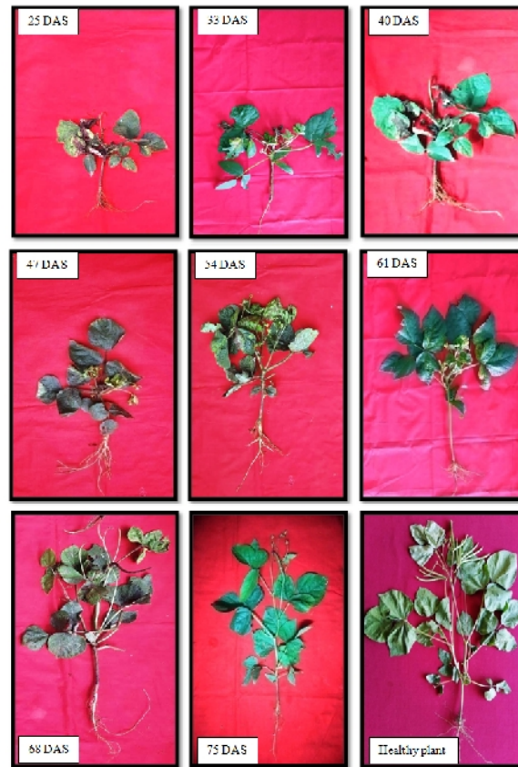
Plate 1: Effect of mungbean bud necrosis disease on plant growth parameters at different stages of infection.

from planting was found effective with the less disease incidence (34.72%) and higher yield (29.12 t/ha) as compared to untreated check (69.44 %; 12.29 t/ha) respectively.