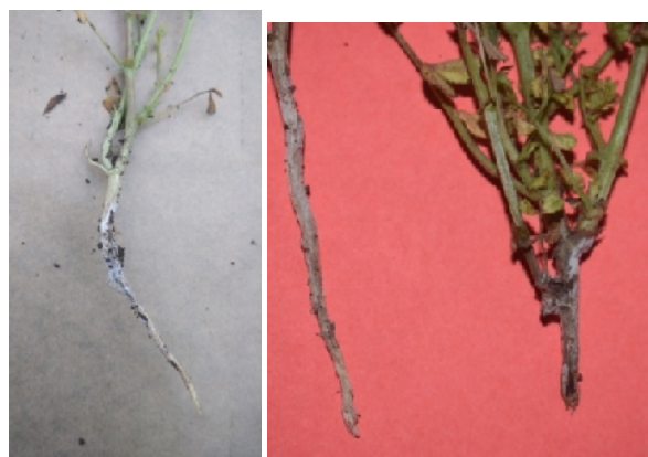
Plate 2: Collar rot affected chickpea plant showing whitish mycelia growth.