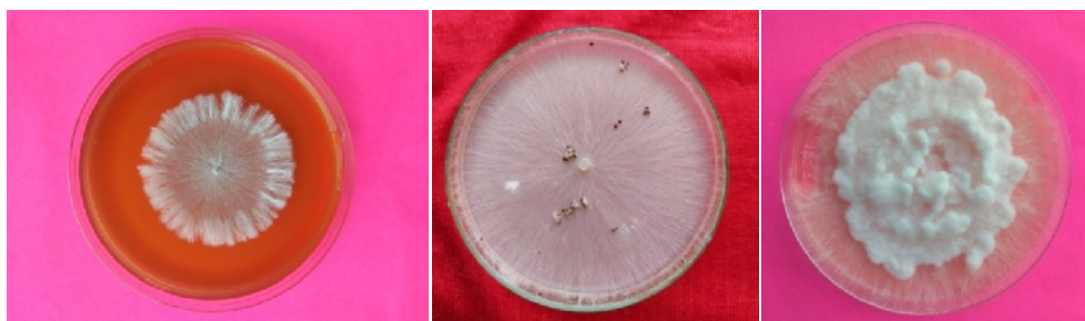
Plate 1: Pure culture of Sclerotium rolfsii isolates.

agroclimatic zones were JAKI 9218, JG 11, JG 12, JG 130, JG 14, JG 16, JG 24, JG 315, JG 322, JG 36, JG 63, JG 74, JG 14, Khajwa (Local), Rahila (Local), RVS 201, RVS 202, RVS 203, Surya 10, Vijay, Vishal. The highest percent mortality was observed in the variety was observed in Rahila (Local) 12.47 % and the minimum of 9.60 % in the variety RVS 201. During survey of major Chickpea growing districts of Madhya Pradesh collar rot appeared at 15 - 45 days old crop and it ranged from 5 - 30 percent (Gupta and Mishra 2009).