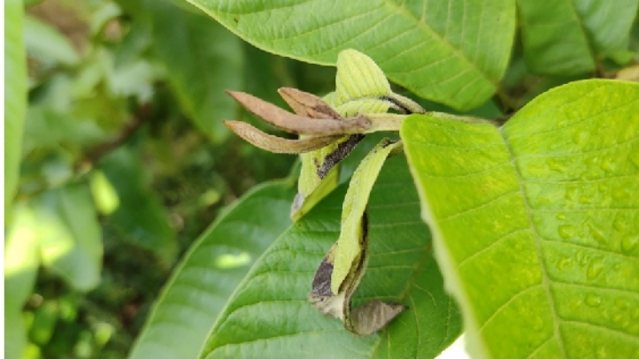
Plate 2: Drying of twigs due to tea mosquito bug.