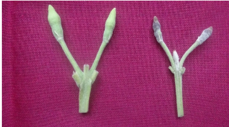
Plate 3: Healthy (left) and infested (right) flower buds.