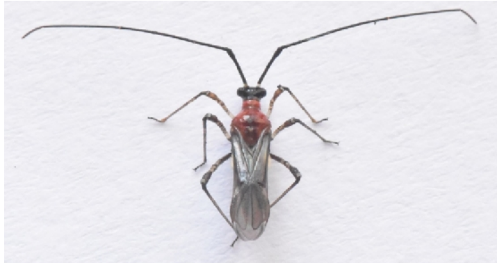
Plate 1: Adult tea mosquito bug, Helopeltis antonii Signoret.