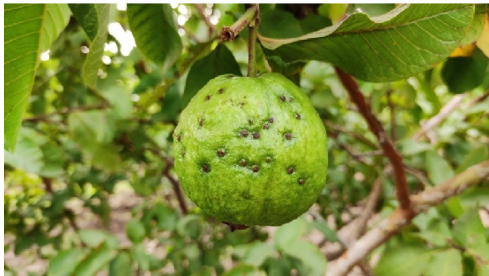
Plate 4: Infestation on fruit caused by tea mosquito bug.