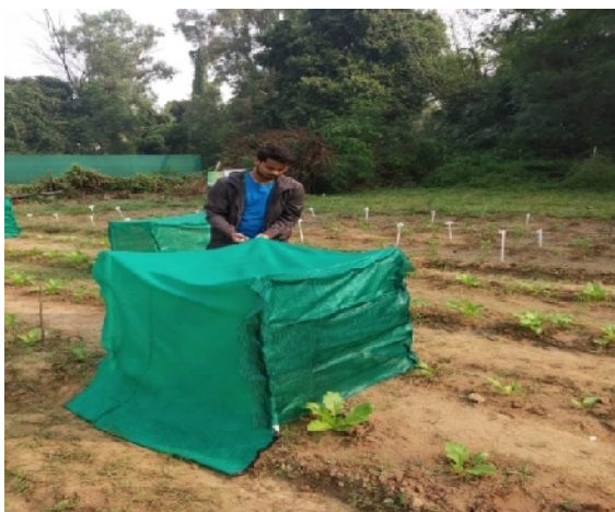
Fig. 2. Installing shade nets in the main field.