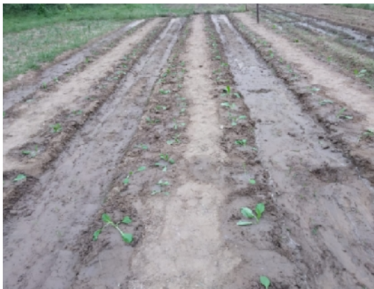
Fig. 1. Transplanting in the main field at Horticulture Research Farm, Department of Horticulture, SHUATS.