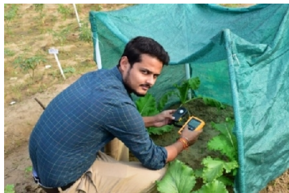
Fig. 4. Recording light intensity in the shade net with the help of lux meter.