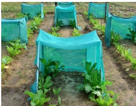
Fig. 3. Growth of crop at 30 DAT in the main field at Horticulture Research Farm, Department of Horticulture, SHUATS.