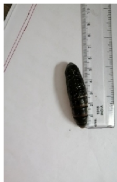
Fig. 5. Casted skin and Pupa. Fig. 6. Pupal measurement.

Adults: The adult highly phototropic; large and robust. The forewings are reddish brown include grey-brown to brown with a reddish-brown lateral band and an irregular dark-brown to black stripe along the edges. White circular spot is conspicuous at the base of the fore wings. Hind wings are red brown to grey-brown with a length of 5.5cm width 1.9cm and hind wings length is 2.9cm. White bands on the abdomen. Males