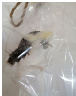
Fig. 3. Final instar larva. Fig. 4. Spinning of cocoon.

Pupa : The final instar larvae was ready for pupation; prior to that it spins a loose transparent yellowish cocoon for pupation. The pupa is dark reddish brown in colour and measured about 5.7cm in length and the total pupal period is 4 weeks the information pertains