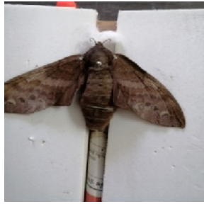
Fig. 7. Adult pine lappet moth.