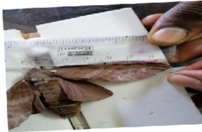
Fig. 8. Forewing length measurement.