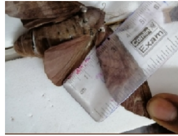
Fig. 10. Length of Hind wing.