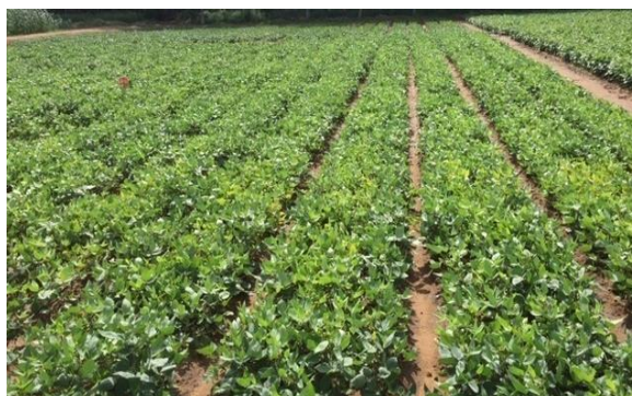
Fig. 2. Experimental Field View during vegetative growth of blackgram.

Treatment was imposed as per the standard method. In T 1 100 % Phosphorus was applied as basal and N and K were given through drip fertigation with urea and white KCl (0:0:60 NPK). In treatment T 2 and T 3 , fertigation was given through water soluble fertilizers viz. urea (46% N), mono ammonium phosphate (12:61:0 NPK), and sulphate of potash (0:0:50 NPK) in 8 splits at an interval of six days, out of which during the vegetative growth period (0-20 DAS) 60% N, 80% P and 20% K in three splits and 40% N, 10% P, and 40% K in three splits at 21-40 DAS (flowering stage). The remaining 10% P and 40% K in 2 splits at 41-55 DAS (Pod formation stage). Fertigation was stopped at 55 DAS. Weeds were controlled by spraying pendimethalin + imazethapyr (valor 32) @ 3liter /ha as pre-emergent on 3DAS followed by one hoeing on 25-30 DAS. The entire quantity of fertilizer (100% N, P, K) was applied as basal in treatment T 4 . Drip fertigation was given once in three days at the vegetative stages and once in 6 days at the reproductive stage (flowering and pod formation stage) as per the treatment schedule. Pulse