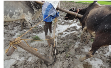
Fig. 3. Measuring length between middle of the yoke with plough for estimating the angle of pull.