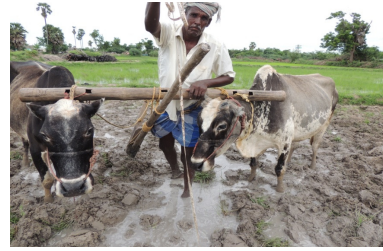
Fig. 2. Measuring vertical distance of the yoke with ground level for estimating the angle of pull.