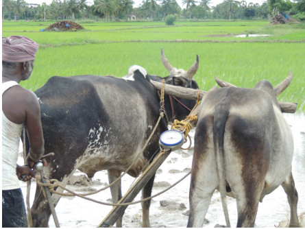
Fig. 1. Measurement of Draft – Pull in Kilograms in umblachery bullocks.

This result was partly supported that there was no influence of age on speed or Horsepower as per Kousalya et al. (2019).