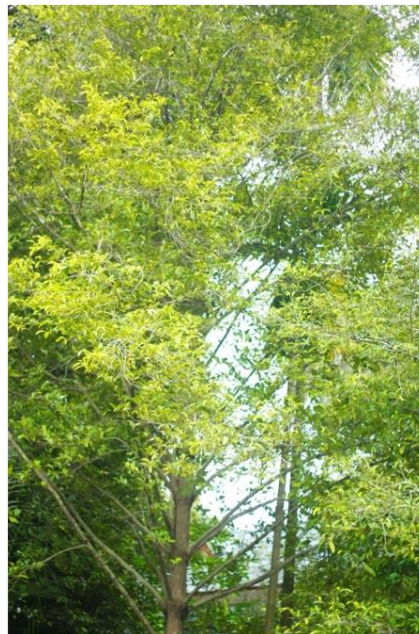
Fig. 1. Habit of the Myristica fragrans Houtt.

leaves are dark green, elliptic, and lanceolate. The petiole is about 1cm long. The tree is dioecious. The flowers are in umbellate cyme. The flowers are small, bracteolate, fragrant and produce nectar. The fruit is ovoid and sub globose. The pericarp is yellow and fleshy. When mature the aromatic pericarp is equally splits into two halves. The brown shiny seed is covered with scarlet coloured net like structure called aril.