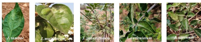
Fig. 2. Crimson spider mite infestation and damage in different species of Jasminum .