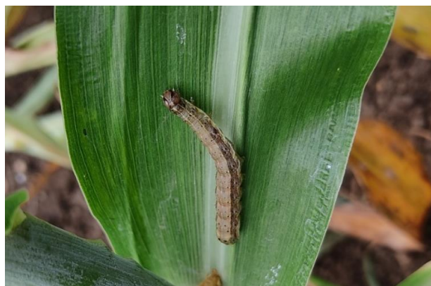
Plate 1. Identification marks of fall armyworm larvae; inverted 'Y' shaped structure on fore head.

Grain and fodder yield from each plot was recorded by weighing them using electronic balance. The fodder yield also recorded in each plot. The data obtained were converted to appropriate transformations and were subjected to statistical analysis to test the level of significance (Gomez and Gomez 1983).