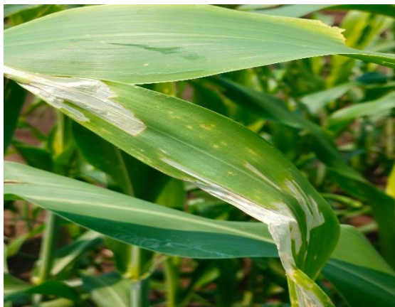
Plate 5. Fall armyworm: silvery transparent membrane structures on the leaves due to feeding by neonate larvae.