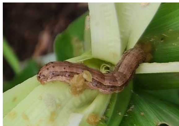
Plate 2. Identification marks of fall armyworm larvae; four square shaped spots on eighth abdominal segment.