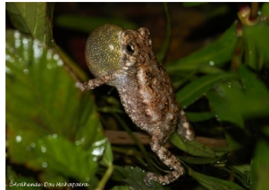
Fig. 3. Lateral view of D. scaber .

(F) Color. Dorsum olive-brown or pinkish-brown with darker markings on the head, the underside of the body yellowish.