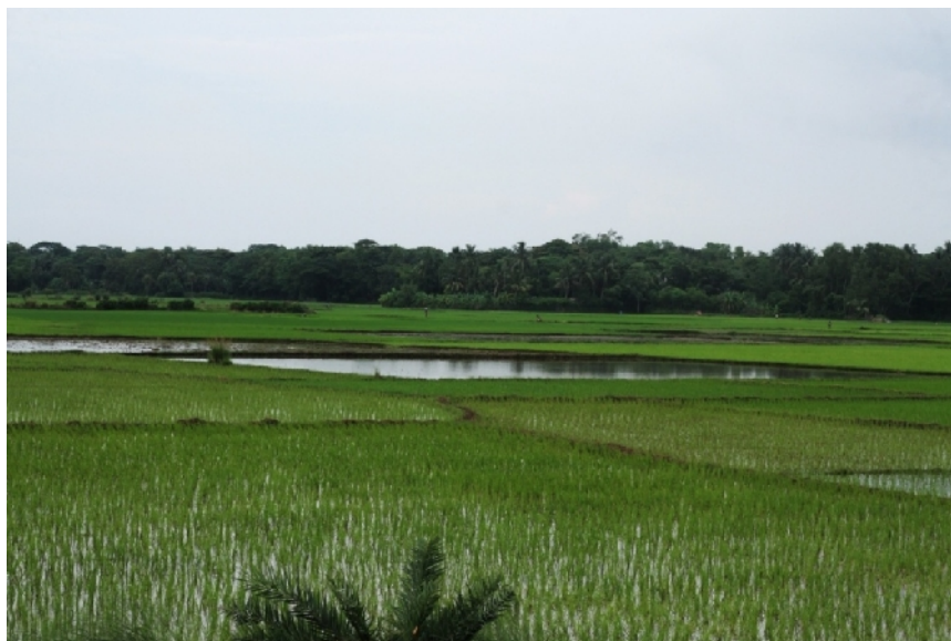
Fig. 4. Habitat of D. Scaber , Mirgoda ganj, Purba Medinipur district.

We are therefore extending the geographic distribution of this species by at least 169 km to the west from the nearest locality Simlipal Biosphere Reserve, Orissa (Dutta et al. , 2009). Therefore, we suggest that further study needed to understand biogeography, road ecology and effects of agrochemicals on different life stages of this species.