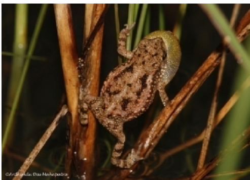
Fig. 2. Dorsal view of D. scaber .