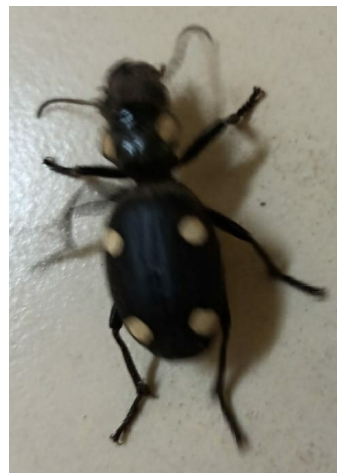
Fig. 2. Six-spot Ground Beetle.