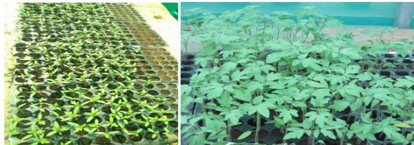
Fig. 2. Raising of tomato seedlings for pot studies on influence of native isolates of Trichoderma spp. on nutrient use efficiency in tomato.