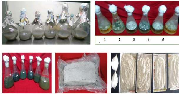
Fig. 1. Mass multiplication of native isolates of Trichoderma spp. A) potato dextrose broth (PDB) medium preparation, B) Fully grown Trichoderma isolates on PDB medium in 1) SMV, 2) SDKd, 3) Commercial, 4) GMV, 5) PSV, 6) CPV, C) Trichoderma spore suspension, D&E) Mixing and drying of Trichoderma suspension with sterile talc powder.