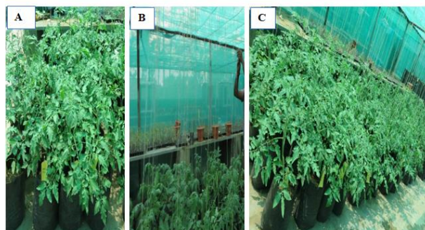
Fig. 5. General view of the experimental setup (at 45 days after transplanting, A&C , B - giving support to tomato plants) of the study on influence of native isolates of Trichoderma spp. on nutrient use efficiency in tomato.