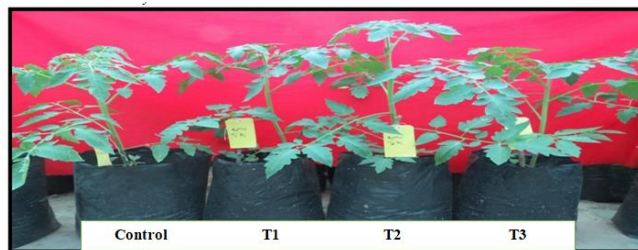
Fig. 3. Tomato plant growth in different treatments with the native isolate GMV ( T. harzianum ) at 30 days after transplanting