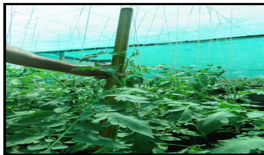
Fig. 4. Taking observations on height of tomato plants influenced by application of native isolates of Trichoderma spp.