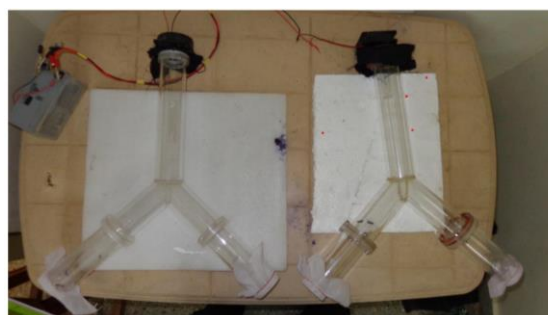
Fig. 2. Y-tube olfactometer.

This investigation focused on assessing the behavioral responses of female X. quadripes to a spectrum of volatile compounds extracted from coffee bark and branches, both in isolation and in combination. A Y-tube olfactometer, crafted from Perspex acrylic (sourced from BCRL, Bangalore), was used (Fig. 2). Hexane served as the solvent for the formulation of solutions for each compound under investigation. The olfactometer, characterized by a 30 cm-long central stem and two arms, each spanning 30 cm, was utilized as the testing apparatus. Specimens were judiciously positioned within two muslin cloth folds, which were employed to seal the olfactometer arms. A diminutive battery-operated fan, positioned 5 cm from the muslin cloth on the exterior, was configured to deliver a controlled airflow rate of 260 ml per minute.