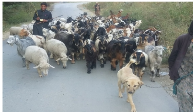
Fig. 2. Tribal communities with watchdogs.