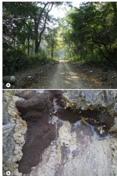
Plate 2: a. A panoramic view inside Valmiki National Park showing patches of Truncospora tephropora (Mont.) Zmitr.; b. Truncospora tephropora (Mont.) Zmitr.

T. elegans (Spreng.) Fr. T. ellipsospora Ryvarden T. variegata (Berk.) Zmitr., Wasser & Ezhov T. vespacea (Pers.) Zmitr., Wasser & Ezhov Truncospora ochroleuca (Berk.) Pilát T. tephropora (Mont.) Zmitr. Psathyrellaceae Vilgalys, Moncalvo & Redhead Psathyrella sp.1 Pleurocybella sp. Schizophyllaceae Quéf. Schizophyllum commune Fr. Schizoporaceae Jülich Leucopellinus hobsonii (Berk. ex Cooke) Ryvarden Schizopora paradoxa (Schrad.) Donk Xylodon flaviporus (Berk. & M.A. Curtis ex Cooke) Riebesehl & Langer Serpulaceae Jarosch & Bresinsky Serpula similis (Berk. & Broome) Ginns Steccherinaceae Parmasto Junghuhnia rhizomorpha H.S. Yuan & Y.C. Dai Stereopsidaceae Sjökvist, E. Larss., B.E. Pfeil & K.H. Larss. Stereopsis dimiticum (Rehill & B.K. Bakshi) Sharma Vuilleminiaceae Höhn. Vuilleminia tropica Hembrom, A. Ghosh, A. Parihar & K. Das Incertae sedis Cyathus striatus Willd. Trichaptum byssogenum (Jungh.) Ryvarden Fungal allies Arcyria cinerea (Bull.) Pers. Arcyria denudata (L.) Wettst. Ceratiomyxa fruticulosa T. Macbr. Stemonitis fusca Willd.