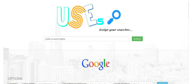
Fig. 1 Interface of the work.

Searching for the user query “books on search engine” in Google and Yahoo in same time we get different search results. The following figures Fig. 1, Fig. 2 and Fig. 3 shows the Interface of the work of unifying search engine, Output with Google and Output with Yahoo respectively.