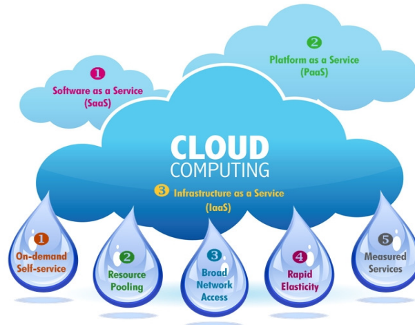
Fig. 1. Characteristics and services provided by cloud computing.

2. Public Cloud- A cloud infrastructure is provided to many customers and is managed by a third party and exist beyond the company firewall. Multiple enterprises can work on the infrastructure provided, at the same time and users can dynamically provision resources [3]. These clouds are fully hosted and managed by the cloud provider. Public clouds offer rapid elasticity and scalability. It is typically based on pay-per use model. There is less visibility and control in a public cloud than a private cloud because the underlying infrastructure is owned by the service provider. Public cloud does not ensure higher level security. Public cloud examples include- Microsoft Azure. Google App Engine.