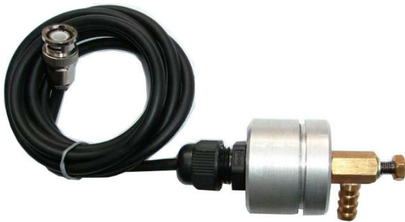
Fig. 2. Piezoelectric Sensor for Measuring Exhaust Gas Pulsations.

In preliminary experiments, the method has been improved by changing the design of the piezoelectric sensor (Fig. 2) and by determining the location (Fig. 3) and the distance of the highest vibration intensity mainly from the signal amplitude.