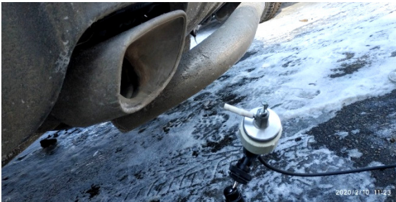
Fig. 3. Location of the Piezoelectric Sensor for Measuring Pulsation.

The design of the sensor has been changed by turning on the adjustment screw, which allows working with engines with any number and working volume of cylinders and exhaust pressure.