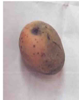
Stem end rot