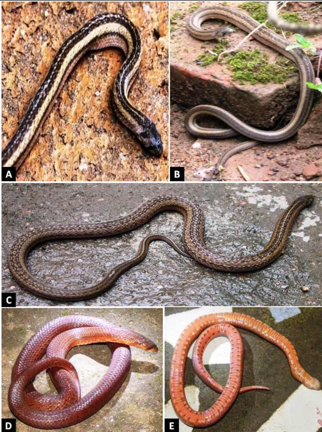
Plate 1:a. Anterior part of Oligodon nikhili b. Oligodon nikhili just emerge after ecdysis c. Adult Oligodon nikhili d. Adult Oligodon kheriensis and e. Ventral side of Oligodon kheriensis .