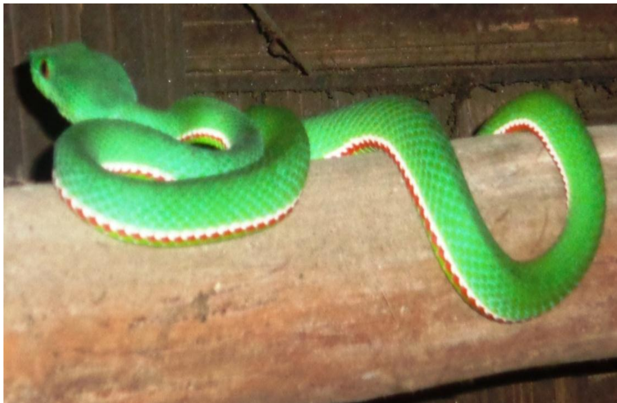
Plate 2:a. Trimeresurus medoensis (Garo Local Name: Chipbu wacheksi)