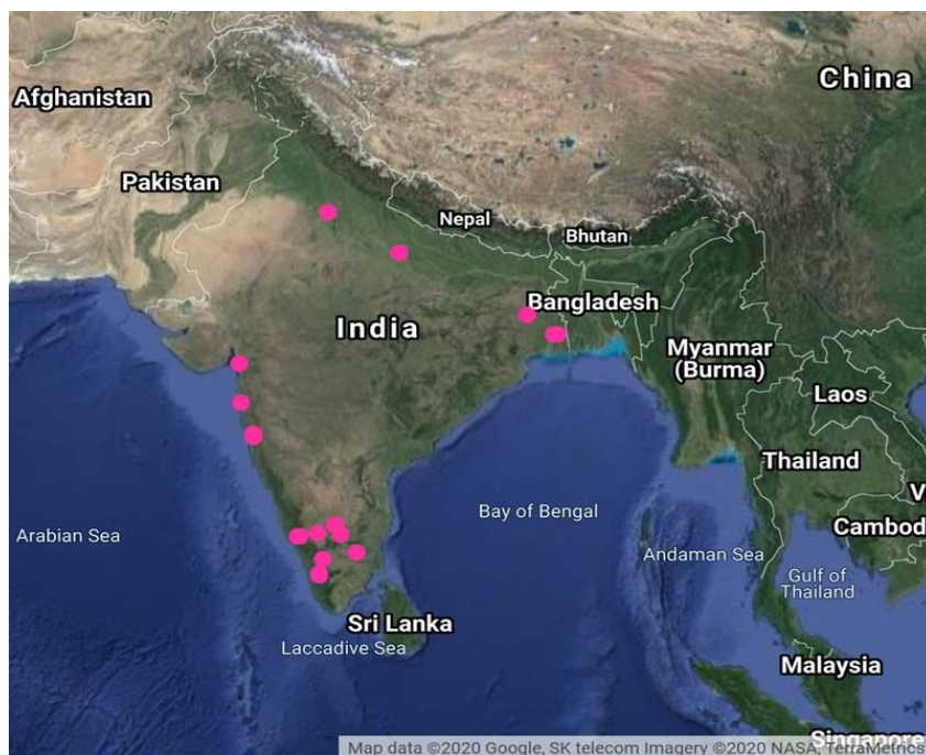
Fig. 1. Map showing distribution of Spindasis schistacea in India (adapted from: https://www.ifoundbutterflies.org/sp/832/Spindasis-schistacea )

The toe of the hill and the surrounding area; more towards the hilly terrain have host plants viz. Combretum indicum , Zizyphus nummularia , Terminalia chebula and Terminalia bellirica , etc.