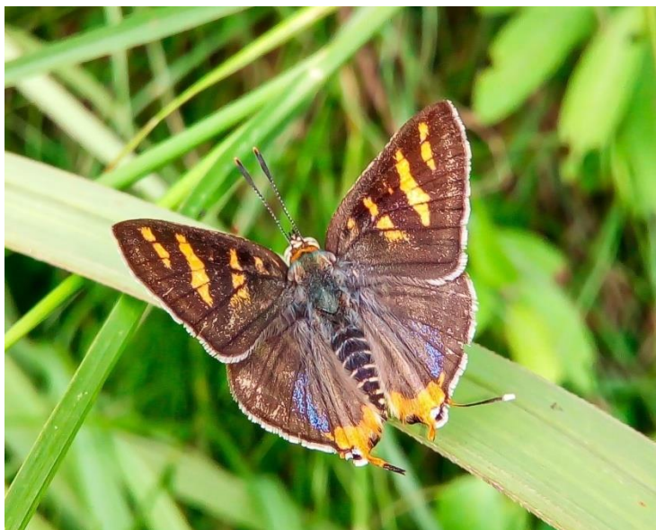
Fig. 3. Top view of the Spindasis schistacea (Plumbeous Silverline) in Balh Valley, Himachal Pradesh, India.

2018). The species may be the resident or migrated from the south extending its range to the north, which is a matter of further research.